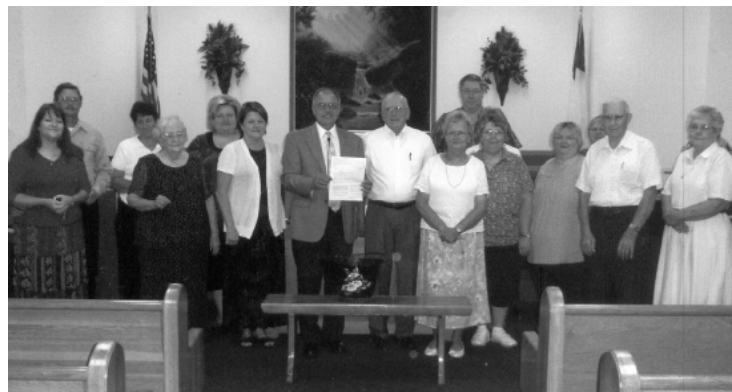
Some of those who attended the celebration of Temple being debt free.