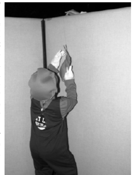
Isaac helping "hook" bags with candy and tracts on fishing poles.